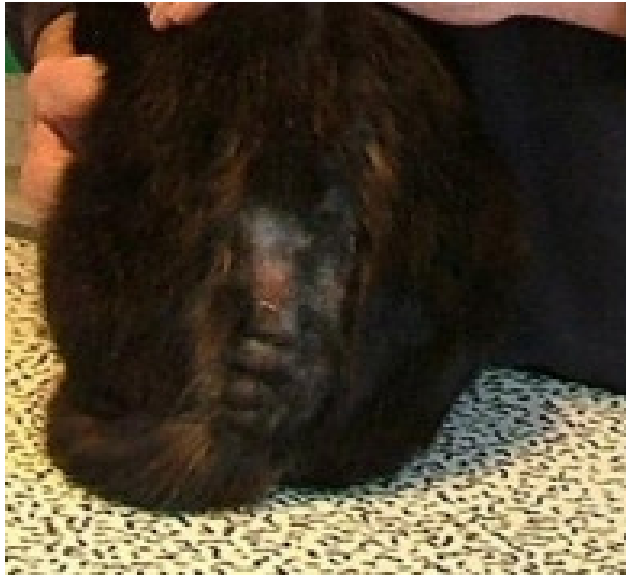
Figure 1 Lesions suggestive of flea allergy dermatitis. A treatment response trial would confirm the diagnosis