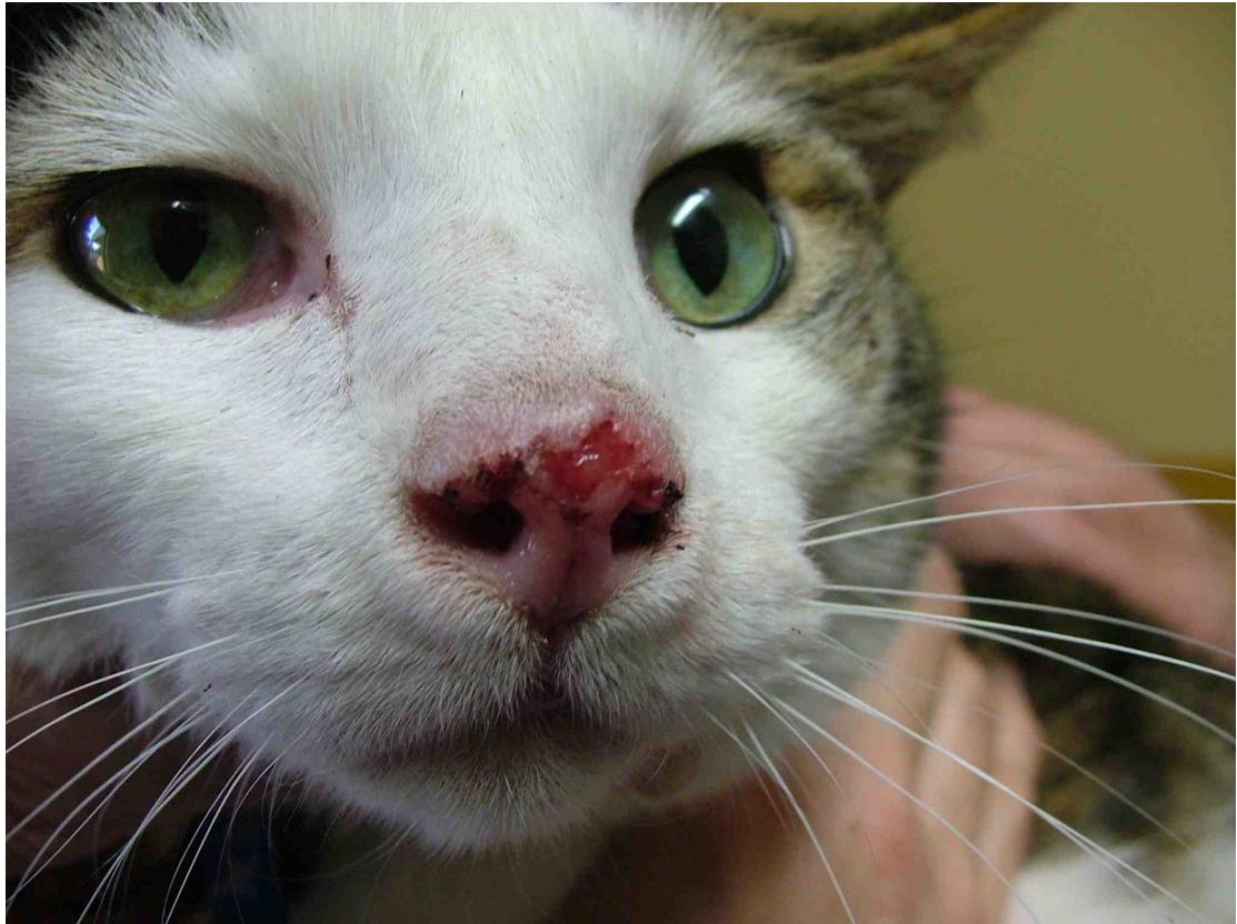
Figure 4. A biopsy, possible PCR and immunohistochemistry would be required to diagnose space this ulcerative lesion. Differentials include squamous cell carcinoma, feline herpes dermatitis, atypical infections and eosinophilic granuloma. The final diagnosis was feline herpes.