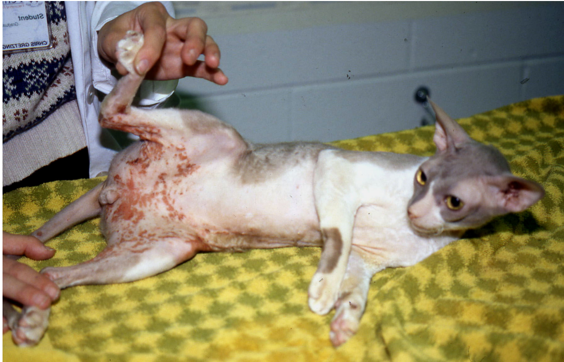
Figure 8. Urticaria pigmentosa occurs in Sphinx or Rex cats as a reaction pattern to allergy. The clinical appearance is that of erythema nodules and plaque. Dr M Rosebaum