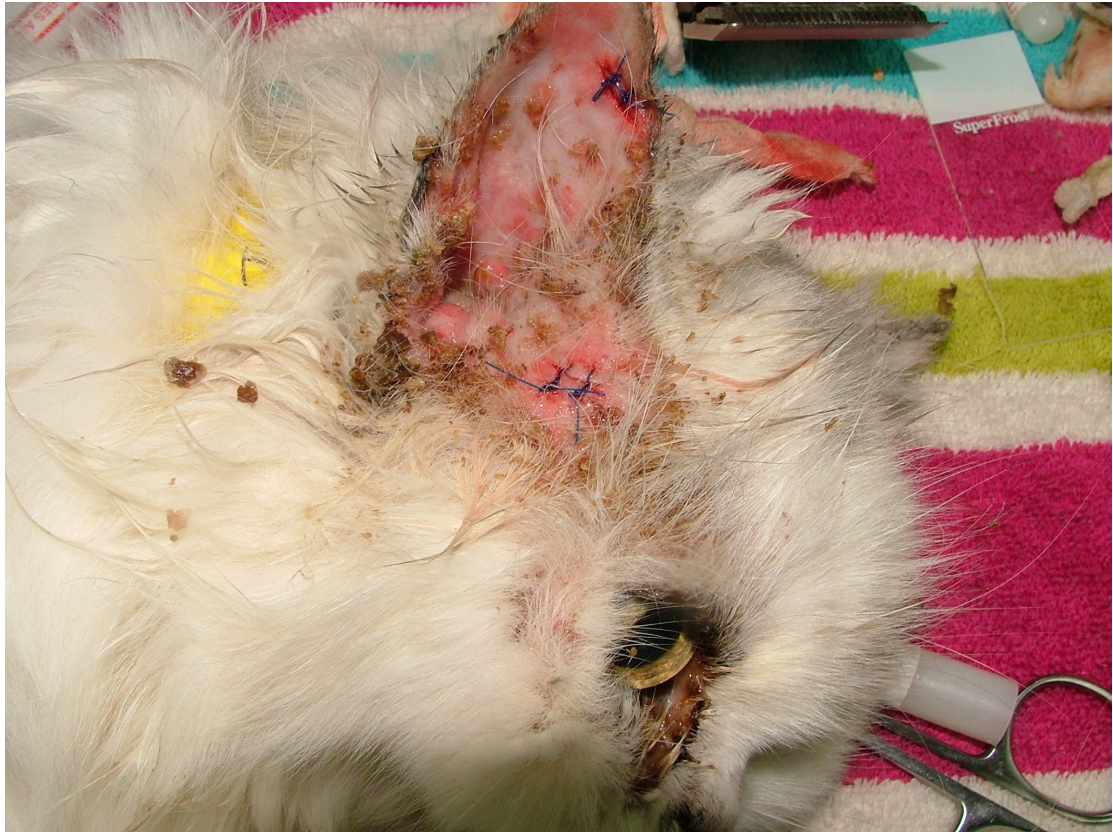
Figure 10. Yellow crusts and pustules that suggest pemphigus foliaceus. Cytology and a biopsy confirm the diagnosis.