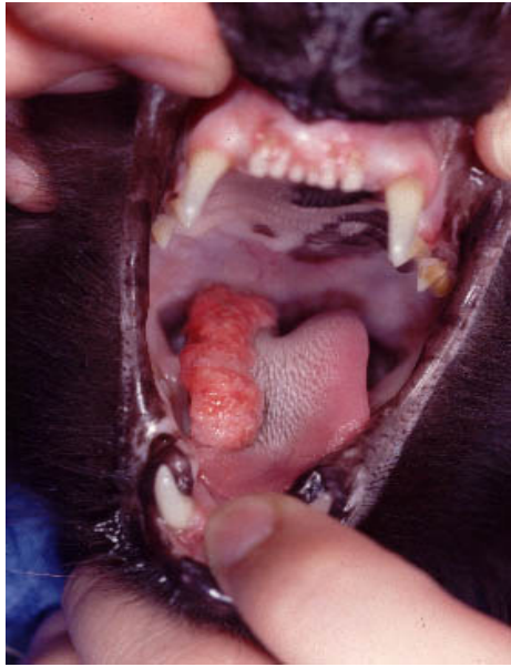
Figure 6. Oral eosinophilic granuloma may occur on the tongue, palette or at the fauces.