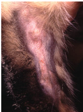
Figure 5 Linear granuloma. A variant of eosinophilic granuloma.