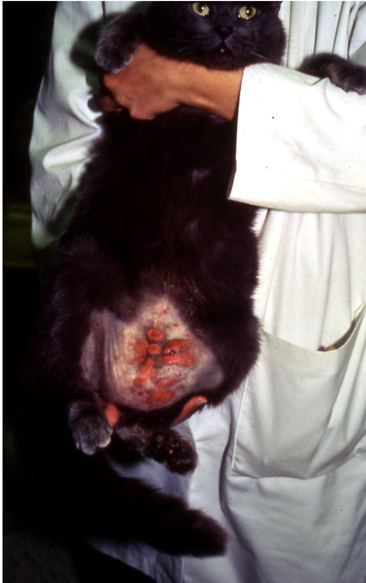
Figure 7. Eosinophilic plaque, most commonly reaction pattern to allergy. Dr. Michelle Rosebaum