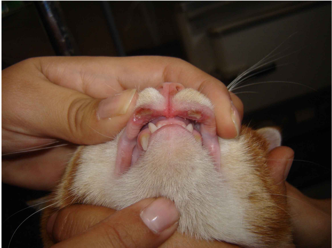
Figure 3 Rodent ulcer. Some cases will respond better to antibiotics than corticosteroids. (Dr V Balazs)