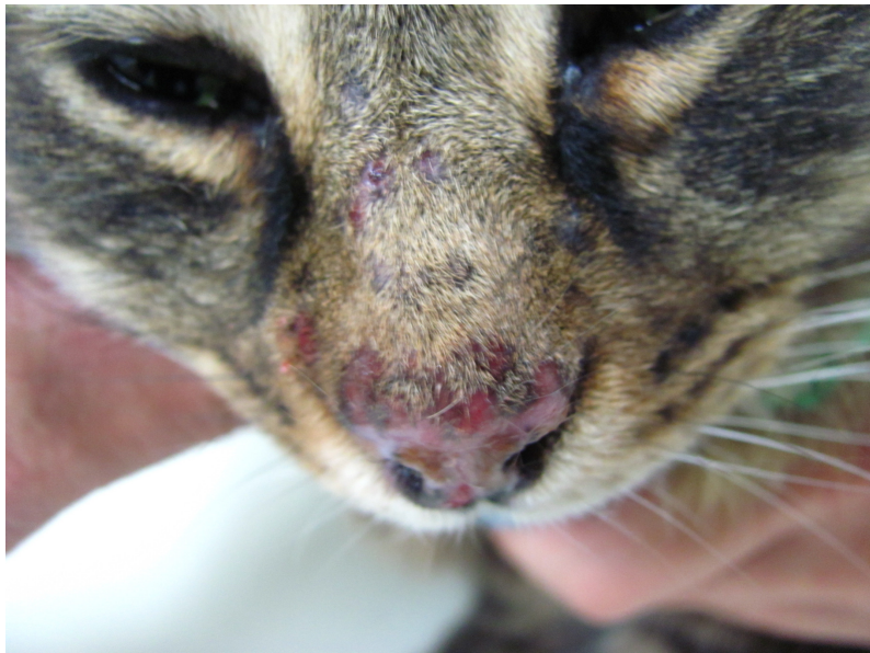
Figure 9. Clinical appearance of focal lesions that suggest mosquito hypersensitivity.