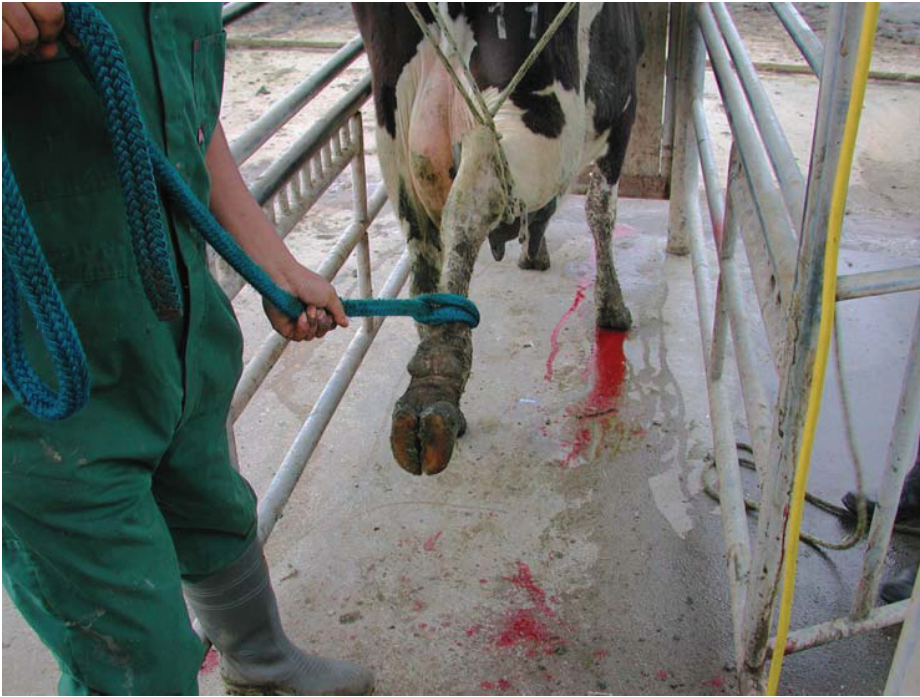
A soft rope is then looped around the raised limb, just above the fetlock.