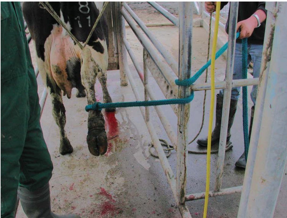
This rope is in placed around the upright as shown.