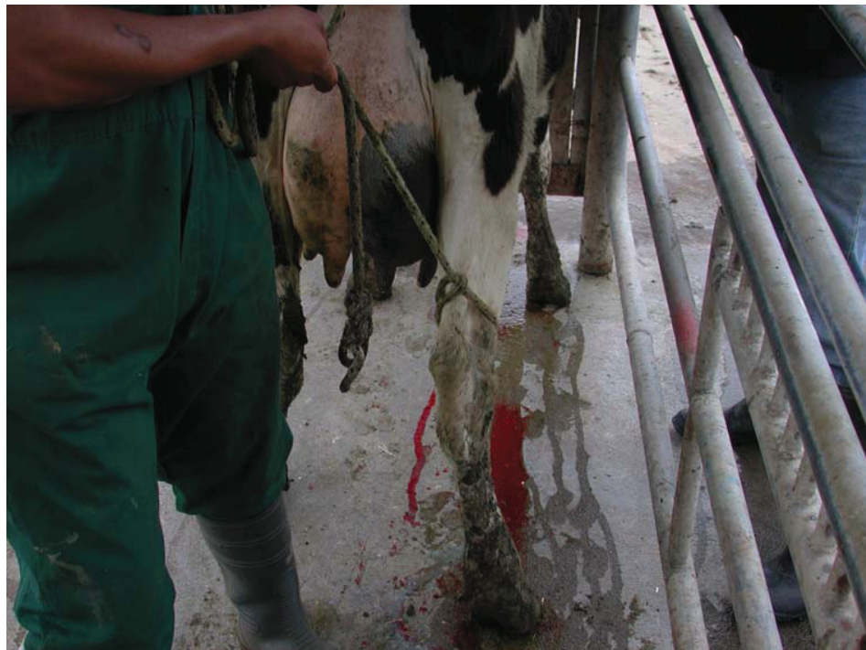
A loop is placed around the limb to be lifted. The loop is placed just above the hock.