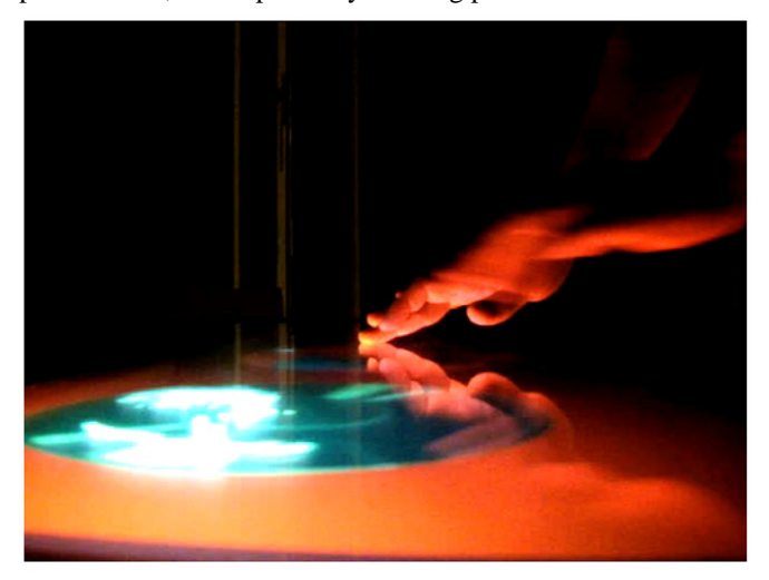
Fig. 5 TouchKit Turntable

Further discussion is required in developing more practical ways of integrating affordance models, object-task performance, and exploratory learning processes within GUI.