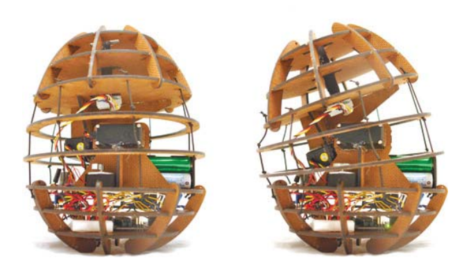
Fig. 2 momo interior

valuable experience. ( fig. 3 ) Pulse Presence is a modular structure that hangs on either side of a wall. Attached