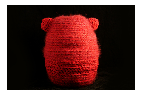
Fig. 1 momo with casing

skill in these computational modes is like remembering a recipe in order to use an application for a desired outcome. [20] The newer generations of haptic interfaces (e.g., multi-touch screens, gesticulative gaming, tactile keybords), allow cognitive processes to be carried out on a basic physical level, but the level of the physicality is still inherently learned and not wholly intuitive. The model still lies on a think-first-and-