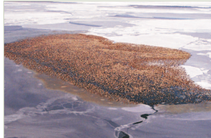
Wintering flocks of spectacled eiders, such as this flock of over 80,000 birds, gather in the pack ice southwest of St. Lawrence Island.

Four principle molting areas have been identified. Two molting areas on the coast of Alaska are eastern Norton Sound and Ledyard Bay, between Cape Lisburne and Point Lay. On the coast of Russia, eiders molt in Mechigmenskiy Bay on the Chukotka Peninsula and an