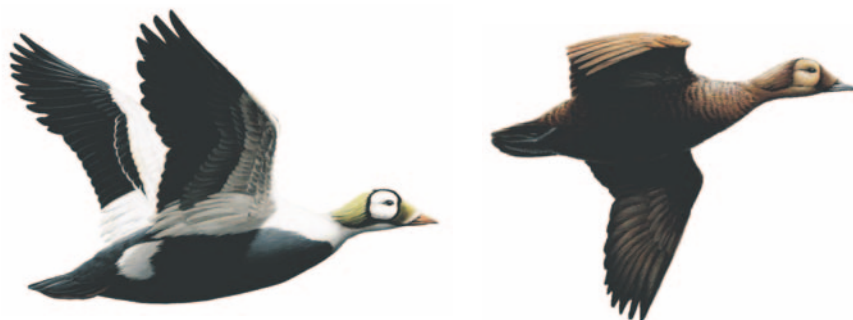
While in breeding plumage (October to June), adult male spectacled eiders have a black chest, white back, pale green head with a long sloping forehead, and white spectacle-like patches around the eyes. From July to September, males are entirely mottled brown. Females and juveniles are mottled brown year-round with pale brown eye patches. One of the largest sea ducks, spectacled eiders average 52-56 centimeters (20-22 inches) in length. Illustration by Joseph Hautman.

In early winter, spectacled eiders have been seen within 50 kilometers of St. Lawrence Island, moving farther offshore as winter progresses. Their late winter location appears to move with annual ice coverage as the birds search for open water. When ice cover is