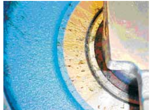
Figure 2 Normal grease purge