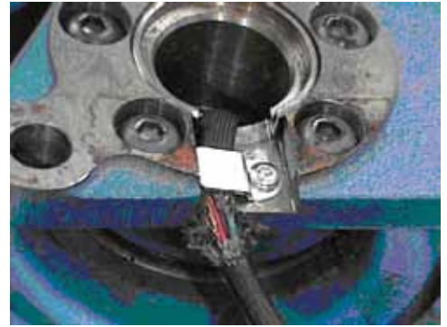
Figure 1 Frayed wire

NOTE: Use of inappropriate fan-to-drive mounting hardware may result in damage to fan drive housing. Order BorgWarner's Cool Logic fan drive fan mounting kit (Part # 010021860).