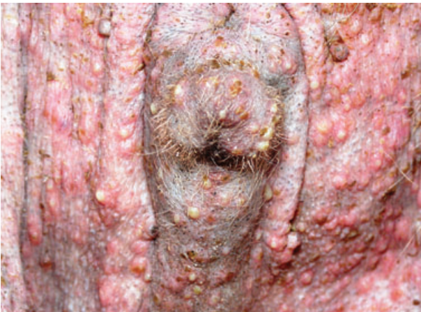
Figure 4. Photograph of the preputial area of the pug from Figure 3. Alopecia, erythema, papules, pustules and crusts are present.

Scenario 2a: the alopecic areas are scaly and erythematous with a few comedones.