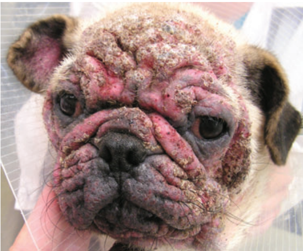
Figure 3. Photograph of the face of a 6-month-old pug with demodicosis. Severe alopecia, erythema, erosions, ulcers and crusts can be seen.