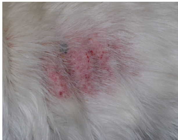
Figure 2. Photograph of the trunk of a 6-month-old West Highland white terrier with localized demodicosis. Note the focal alopecia, erythema, papules and small ulcers and crusts.

ther progression to generalized disease or spontaneous remission is the recommended option.