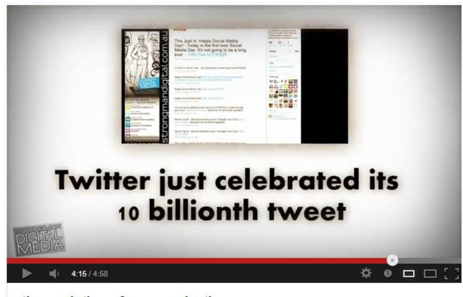
the evolution of communication