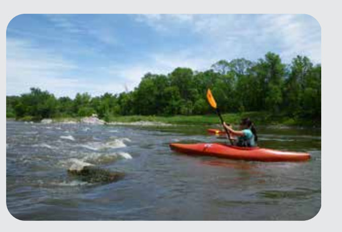
Pockets of rapids can be found along this stretch.

At the area around Redwood Falls, paddlers will encounter thick forest and high ridges that tower above the Minnesota River. Bordering the river is the recently created Whispering Ridge Aquatic Management Area, part of the effort of the Green Corridor Project to provide a trail system from Skalbekken County Park to Fort Ridgely State Park. You will also find a rock ledge that was once dynamited to allow steamboats upstream.