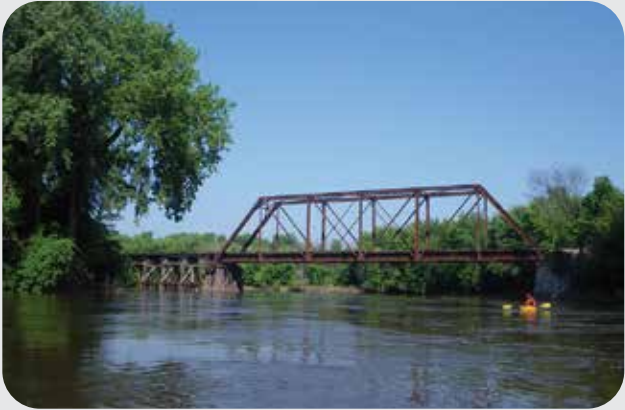
Railroad bridge at Morton.

The canoeable portion of the Cottonwood River begins in the city of Springfield and ends 58 river miles later when it empties into the Minnesota River near New Ulm. Carved out some 10,000 years ago, the steep slopes are now saturated with maple, basswood, and hackberry trees, with oak and red cedar on the sunny side. There are no major rapids, which makes this a good river for beginning paddlers. Near the confluence with the Minnesota, the river flows through Flandrau State Park, which offers some great hiking and overnight stay opportunities.